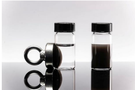
Figure 1: MagDx™ beads in response to an external magnetic field